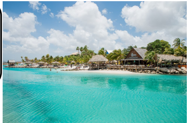
Ocean view of Lions Dive Resort, Curacao

Exclusions: Airfare; Nitrox ($10/tank, $30 day unlimited); Meals other than breakfast and drinks; extra excursions. Must provide certification card, nitrox cert. card, passport and personal diving system and DAN Insurance. Trip cancellation and baggage HIGHLY recommended on international trips. Add 4% if paying with Credit card. Lets Go!